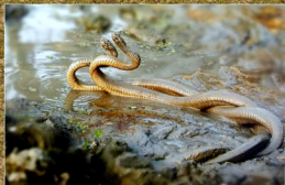
SNAKE PAIR-II, Amitava Das, NBPC