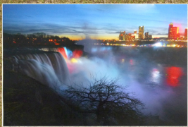
NIAGRA AT NIGHT- R V. Subramaniam, Hyderabad