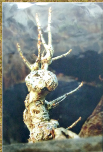
NATURE#1 - Sarmali Das, Kolkata