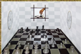
CHESS - Arup Guha, Coochbehar