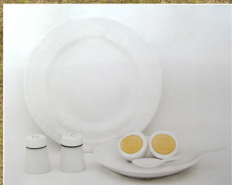
NASTA – Tapan Kr Das- kolkata