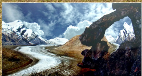
TOWARDS THE LIGHT - Swapan Das, Howrah