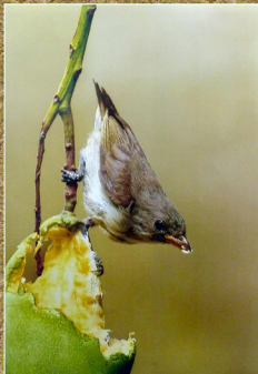
BIRD WITH FOOD - Debabrata Sarkar, Raiganj