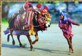
BULL FIGHT - ch. V.S.Vijaya Bhaskara Rao