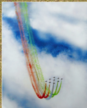
AIR FORCE SHOW - V Narayana Rao, Hyderabad