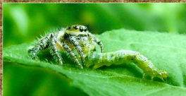
SPIDER WITH LILL- Subrata Das - Coochbehar