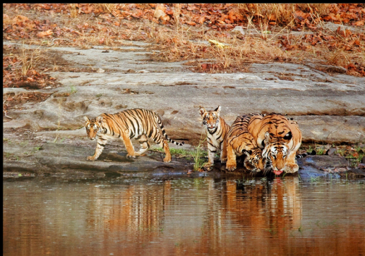
TIGER FAMILY AT WATERHOLE