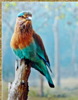
BLUE JAY - Rupak De, Lucknow