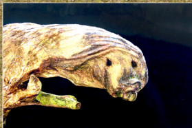
ALIEN 2 - Shuvashis Saha, NBPC, Raiganj