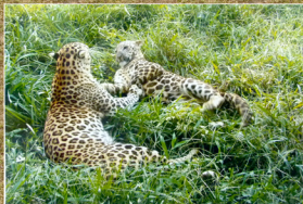
AFFECTION - Ranjit Chakraborty, Coochbehar