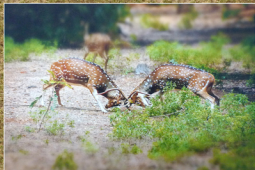
NOT ENDERING - Piyush Chakraborty, siliguri