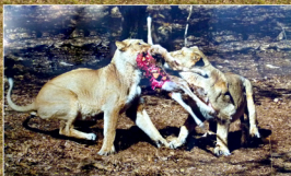
LIONESS WITH KILL- B S Ullas Shanbhag