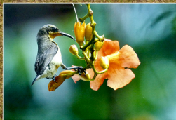
SUNBIRD IN ACTION - Bibhuti Bhusan Nandi Coochbehar