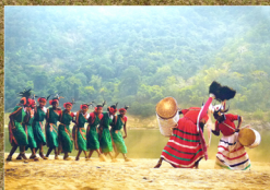
DANCE WITH DRUMS - V K R S Sarma, AP