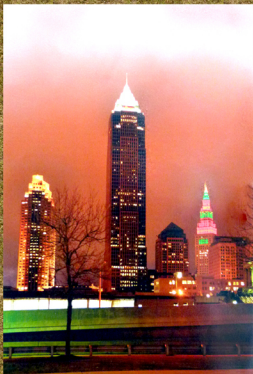
DOWN TOWN -- Maroju Srinivas A.P.