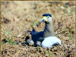
LAP WING WITH EGG- H S Bykod , Bangalore