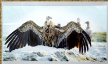
WHITERBACKED VULTURE - Subrata Kar, Siliguri