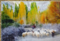
END OF THE DAY - Apurba Kr Das, Howrah