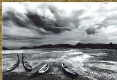
AWAITING SAIL - Pinaki R Ralukdar, kolkata