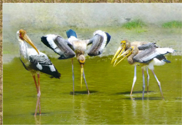
PAINTED STORK AND FAMILY, Debabrata Bhattachajyy, NBPC