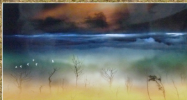
SILENT CONVERSATION- Goutam Chatterjee, Howrah