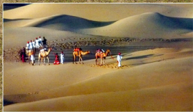
DESERT SAFARI - Ratan ch karmakar, NBPC Raiganj