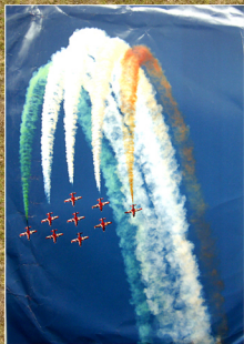
TRI COLOUR - Purushotham P, Bangalore