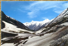
ZOZILLA PASS - Barhadath D, Hyderabad