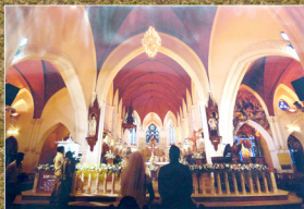
COLOURFUL WEDDING - Anagn Sanyal, kolkata