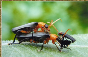
MATING WITH FEED- Dhritiman Hore, Coochbehar