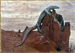
LIZARD RESTING - Prasad B S, Bangalore