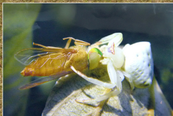
CAUGHT RED HANDED - Rituparna lahiri, Raiganj